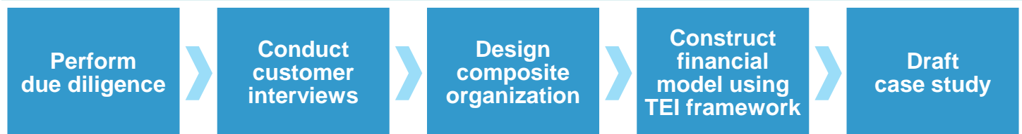
FIGURE 2 TEI Approach

Given the increasing sophistication that enterprises have regarding ROI analyses related to IT investments, Forrester's TEI methodology serves to provide a complete picture of the total economic impact of purchase decisions. Please see Appendix A for additional information on the TEI methodology.